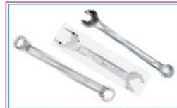
SPANNERS GROUP PAGE 10 - 12