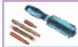
SCREW DRIVER BITS PAGE 4 - 5