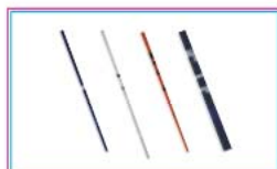
HACKSAW BLADES PAGE 13