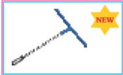
T SOCKET WRENCH PAGE 6