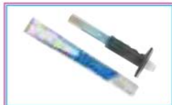
CHISELS PAGE 12