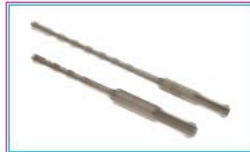
PLUS HAMMER DRILLS PAGE 18-19