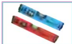
SPIRIT LEVELS PAGE 17