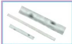
TUBULAR SPANNER & SET PAGE 10