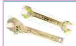
NON SPARKING TOOLS PAGE 21-25