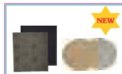
ABRASIVE LATEX PAPER & VELCRO DISC PAGE 18