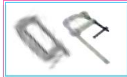
C & F CLAMPS PAGE 9