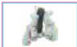
BEARING PULLERS PAGE 13