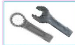
SLOGGING SPANNERS PAGE 11-12