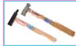
HAMMER GROUP PAGE 9