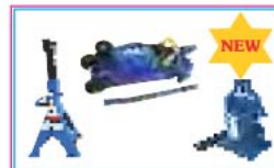
JACK STAND, HYDRAULIC TROLLEY JACK & HYDRAULIC BOTTLE JACK PAGE 16