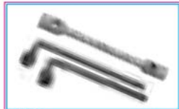
WHEEL / BOX SPANNER PAGE 10