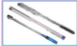
TORQUE WRENCH GROUP PAGE 8