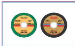
CUT OFF WHEEL PAGE 17-18