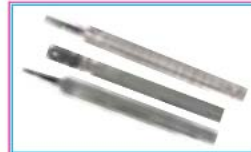
STEEL FILES PAGE 19-20