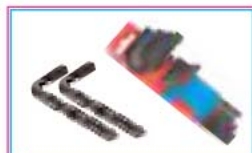
ALLEN KEYS & SETS PAGE 13 - 15