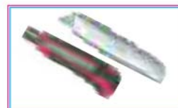
SNAP OFF CUTTERS PAGE 13