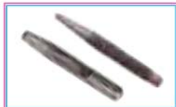
PUNCHES & SETS PAGE 12