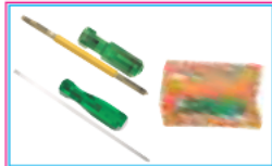
SCREW DRIVERS GROUP PAGE 2 - 4