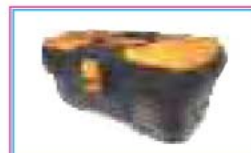
PLASTIC TOOL BOX PAGE 16