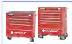
TOOLS TROLLEY PAGE 16