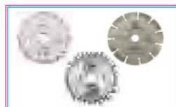
DIAMOND, TILE & WOOD CUTTING BLADES PAGE 17