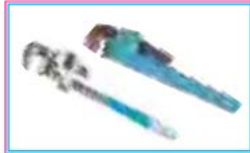
PIPE WRENCH GROUP PAGE 8 - 9