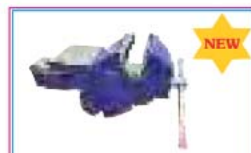
BENCH VICE PAGE 17