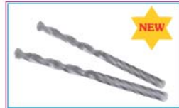
MASONRY DRILL BITS PAGE 18