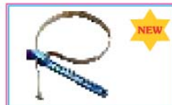
STRAP FILTER WRENCH PAGE 16