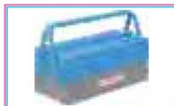
CANTILEVER TOOL BOX PAGE 15