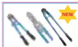
BOLT, TIN & CABLE CUTTERS PAGE 12 - 13