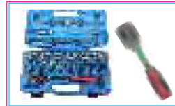
SOCKET, ACCESSORIES PAGE 5 - 8