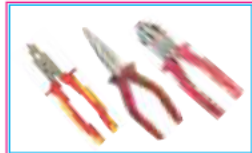
PLIERS GROUP PAGE 1 - 2