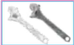
ADJUSTABLE SPANNERS PAGE 1