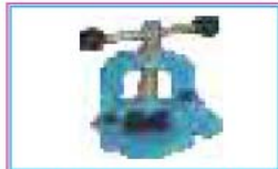
PIPE VICES PAGE 10