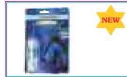
CHALK LINE REEL SET PAGE 18