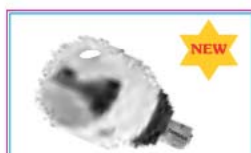
BI METAL MINI HOLE SAWS PAGE 18